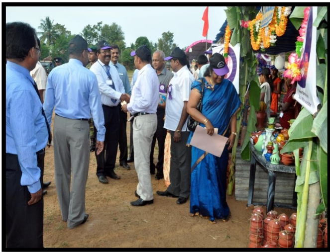
Hon. Minister Visiting Stalls of Women Entrepreneur at Trade Fair in Batticaloa in April 2013.