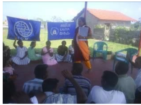
Fire prevention Training