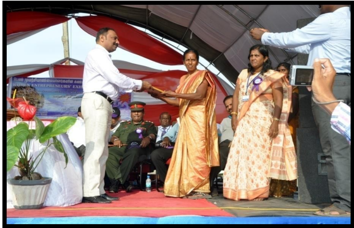
Hon. Minister Awarding Best Women Entrepreneur at Trade Fair in Batticaloa in April 2013.